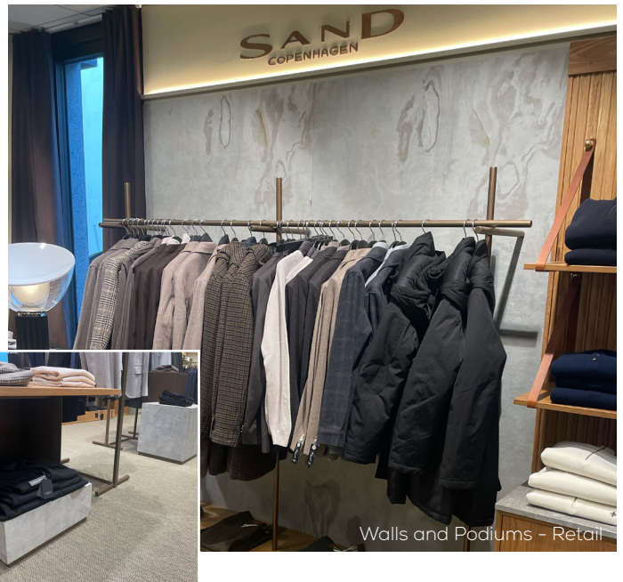
Walls and Podiums - Retail