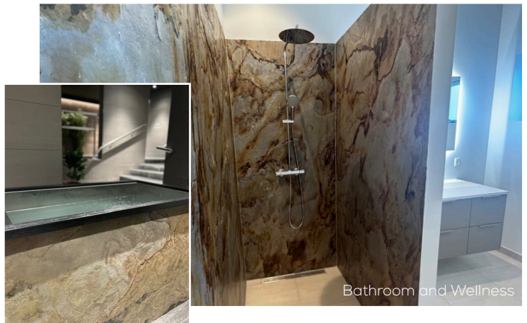
Bathroom and Wellness

Suitable for walls, receptions, kitchens, facades, lamps, wet areas – indoors & outdoors