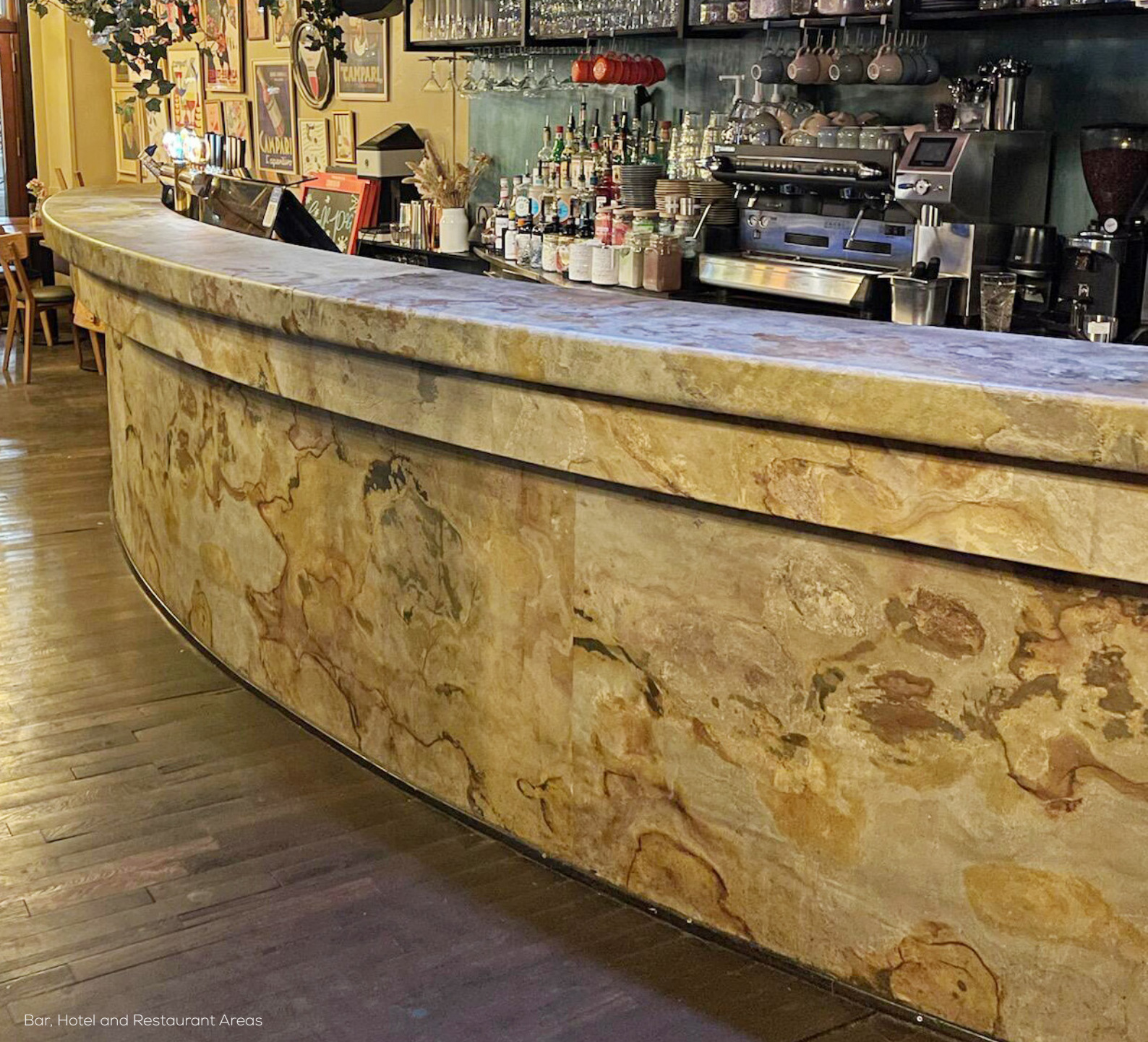
Bar, Hotel and Restaurant Areas